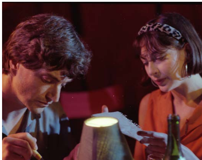
— “The Wandering Soap Opera”, Raúl Ruiz’s 121st film. —