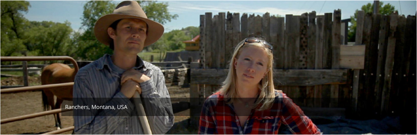
Ranchers, Montana, USA