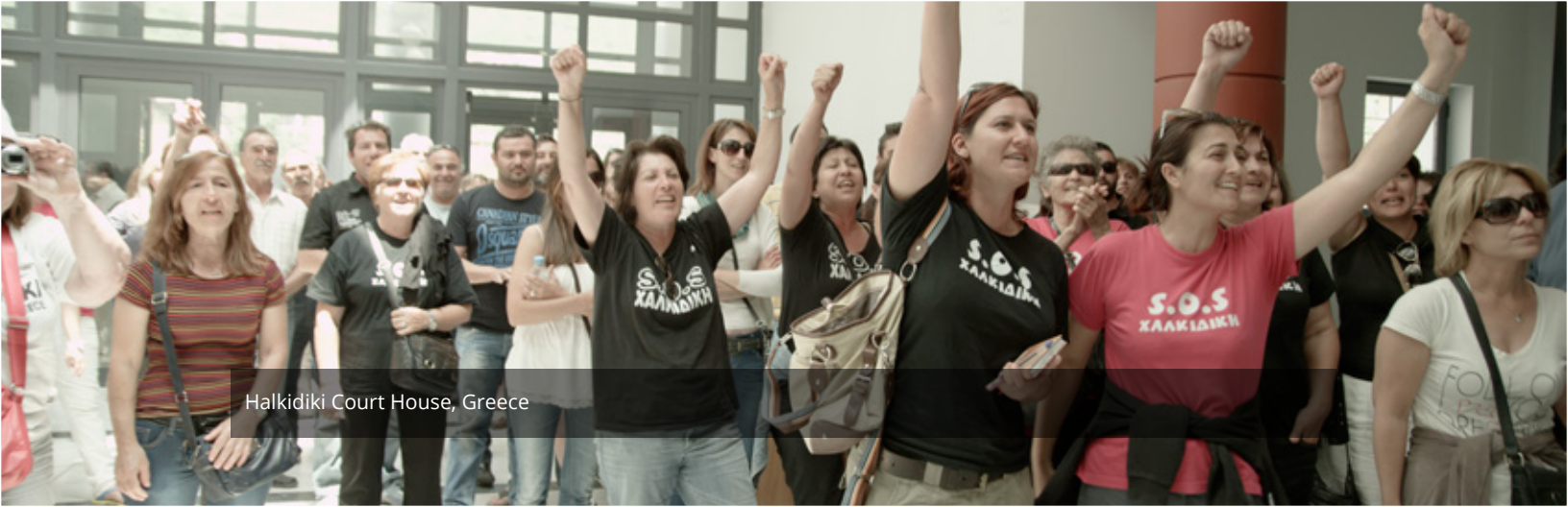
Halkidiki Court House, Greece