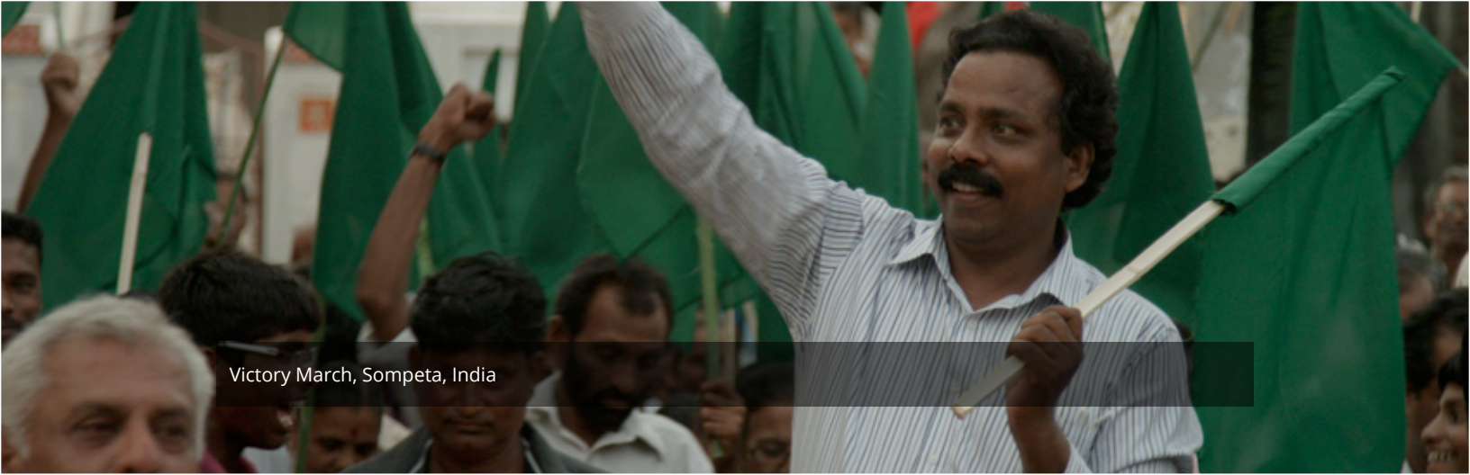
Victory March, Sompeta, India