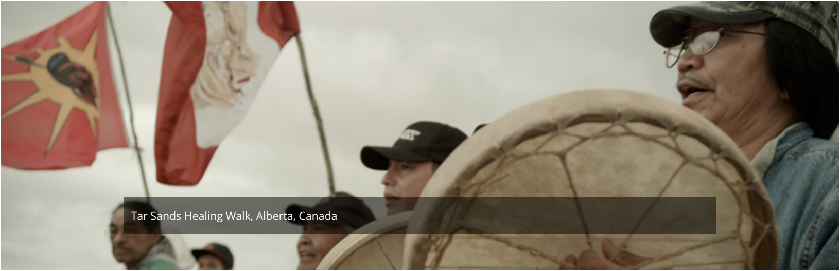
Tar Sands Healing Walk, Alberta, Canada