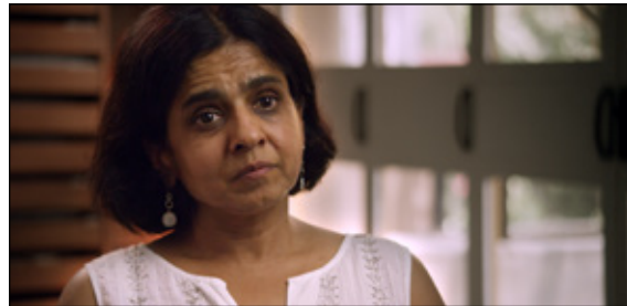
Sunita Narain Centre for Science and Environment