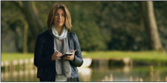
Naomi Klein Author, This Changes Everything