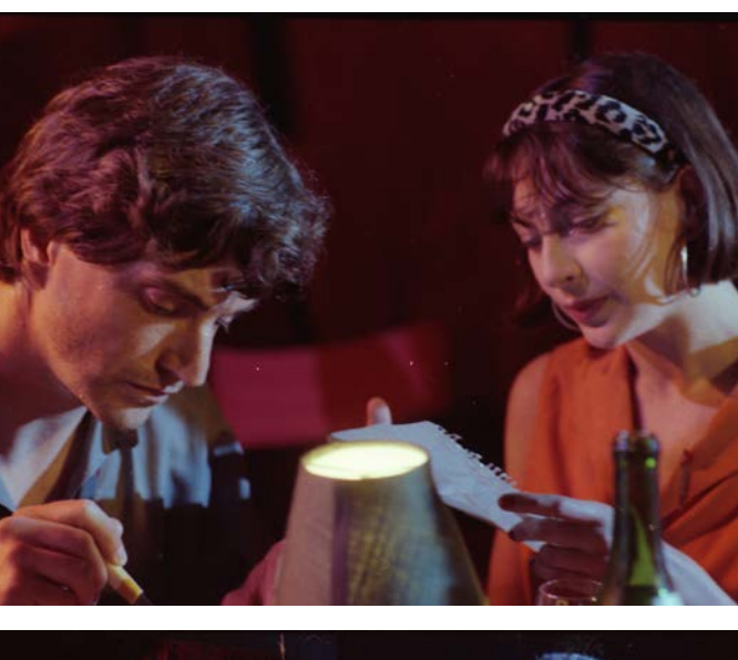
"The Wandering Soap Opera", Raúl Ruiz's 121st film.